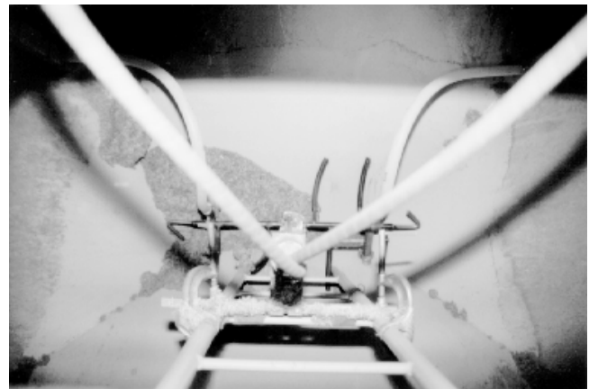
Morris 6130 Agitator