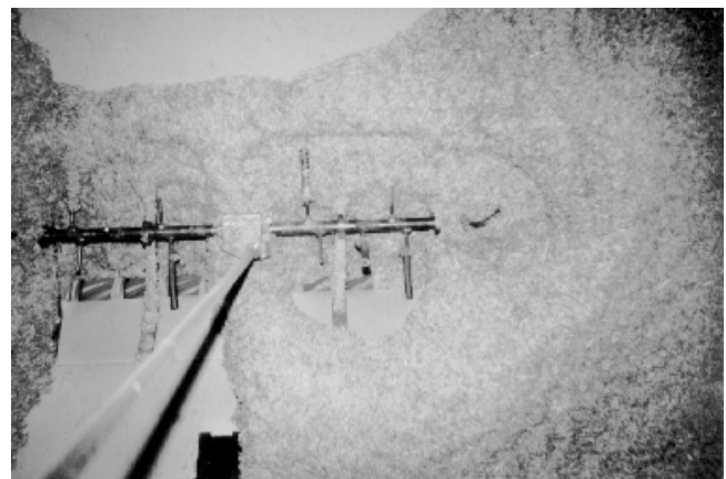
Flexi-coil 1720 Agitator